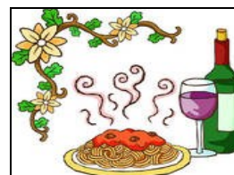
Table reservations are made in the Lounge