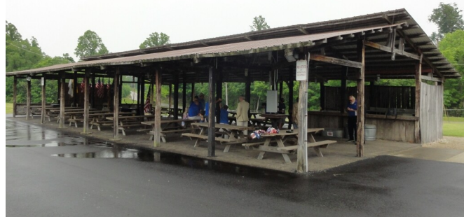
Exalted Ruler Mike Null and the Gallipolis Elk Trustees are proud to present to our members a renovated Farm building with a kitchen and restrooms, along with the shelter and blacktop patio. These facilities are available for rent for your summer time outdoor activities.