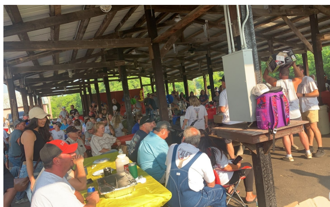
On Saturday, 17 June, family and friends of a Gallipolis Elks Member, who has been diagnosed with ALS, sponsored a benefit at the Elks Farm to raise money for medical expenses and home equipment to assist in countering the effects of ALS. Our community responded to the task and raised over $35,000!!