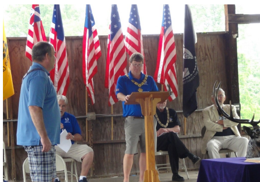
Gallipolis Elks Lodge Officers are shown conducting the Flag Day ceremony at the Farm on 11 June. At the conclusion of the ceremony, a picnic menu was provided to all that were in attendance.