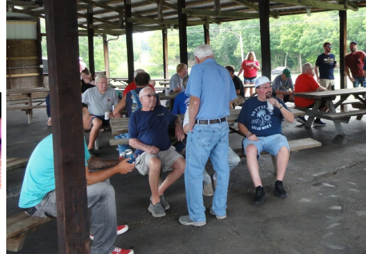
Just getting started